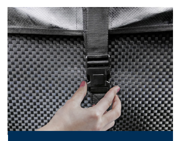
Secure locking system

Powered by the Netspa motor unit, it independently manages filtration, heating, and the release of relaxing bubbles, all controlled with a simple press of a button.