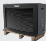
Delivered on wooden pallet

The Jetline Premium Fi keeps, however, all its features that contributed to its success: its reversible function that allows it to operate down to -15°C, its automatic defrosting capacity and its titanium twisted tech heat exchanger guaranteed 15 years. Confident of the reliability of our products, the Jetline Premium Fi is guaranteed 3 years.