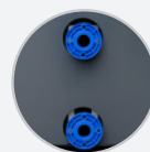
Large-diameter fittings for professional ponds