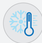
Wide operating range down to -15°C