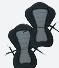
Kayak seat x2